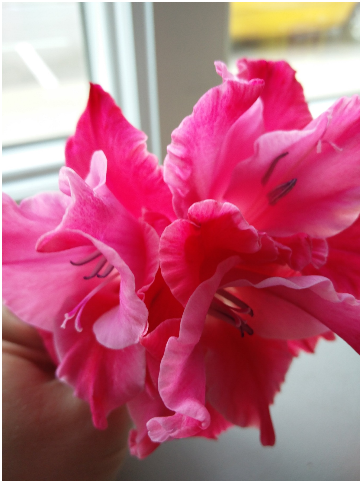
"Gladiola" Photo by R.J. Hughes, 2017