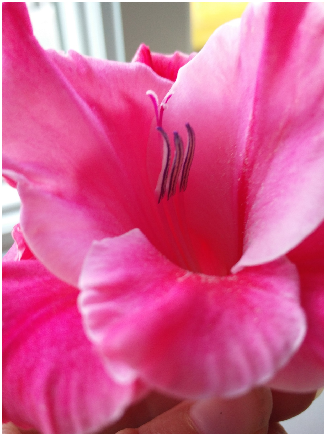
"Gladiolous" Photo by R.J. Hughes, 2017.