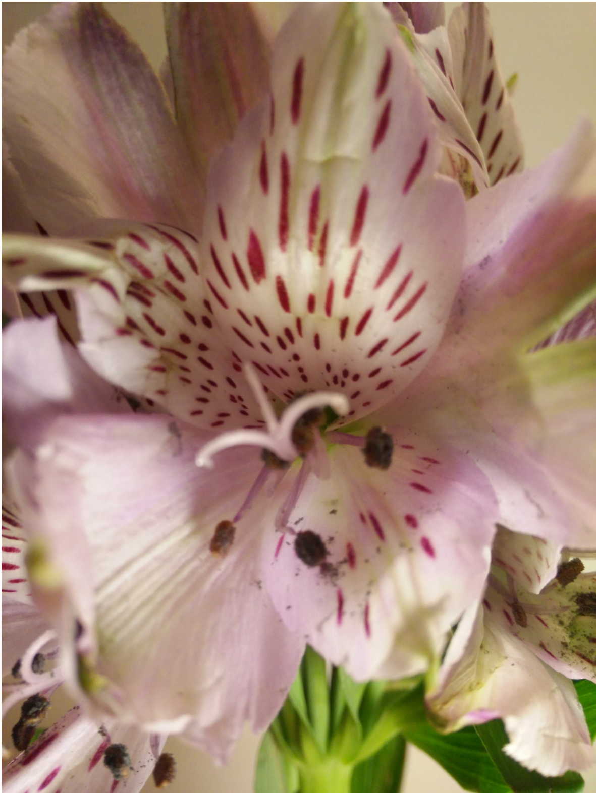
"Alstroemeria" Photo by R.J. Hughes; 2017