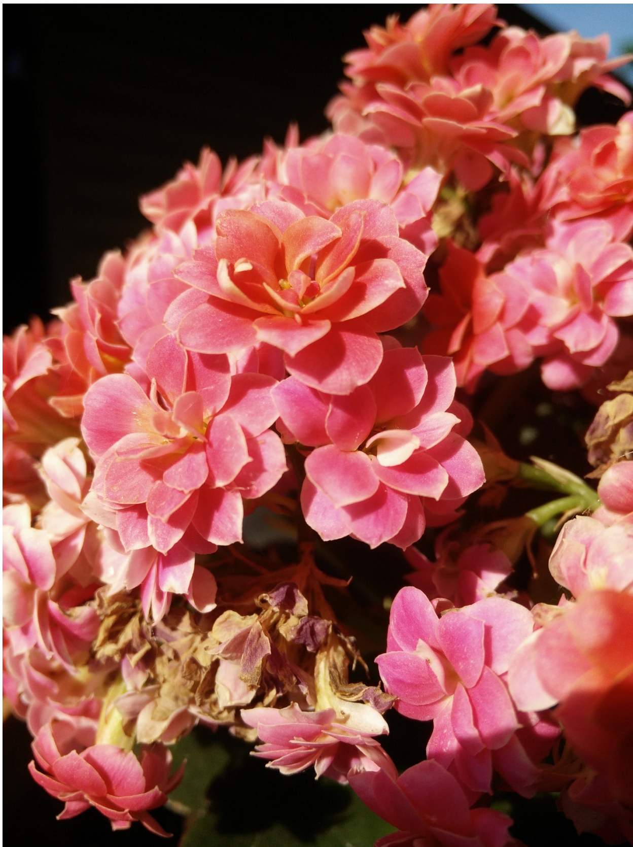
"Kalanchoe" 2017