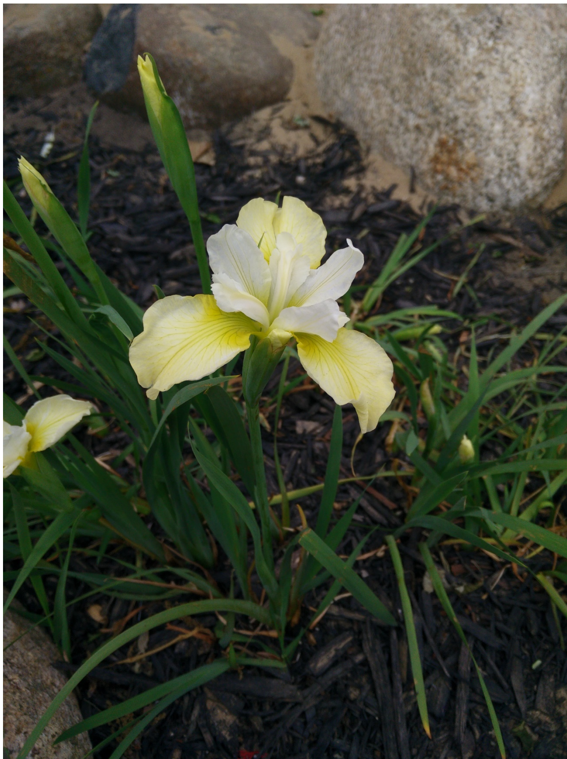
Japanese Iris; 2017.