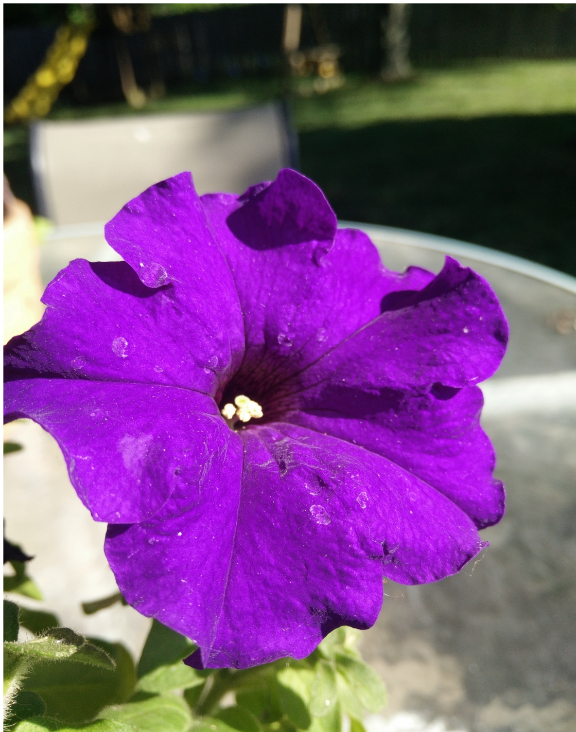
"Petunia" Photo by R.J. Hughes; 2017