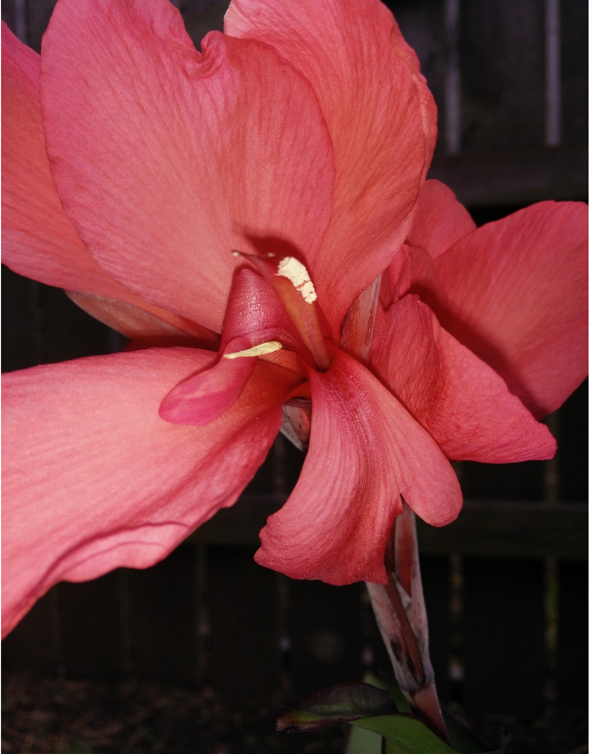
“Red Canna”