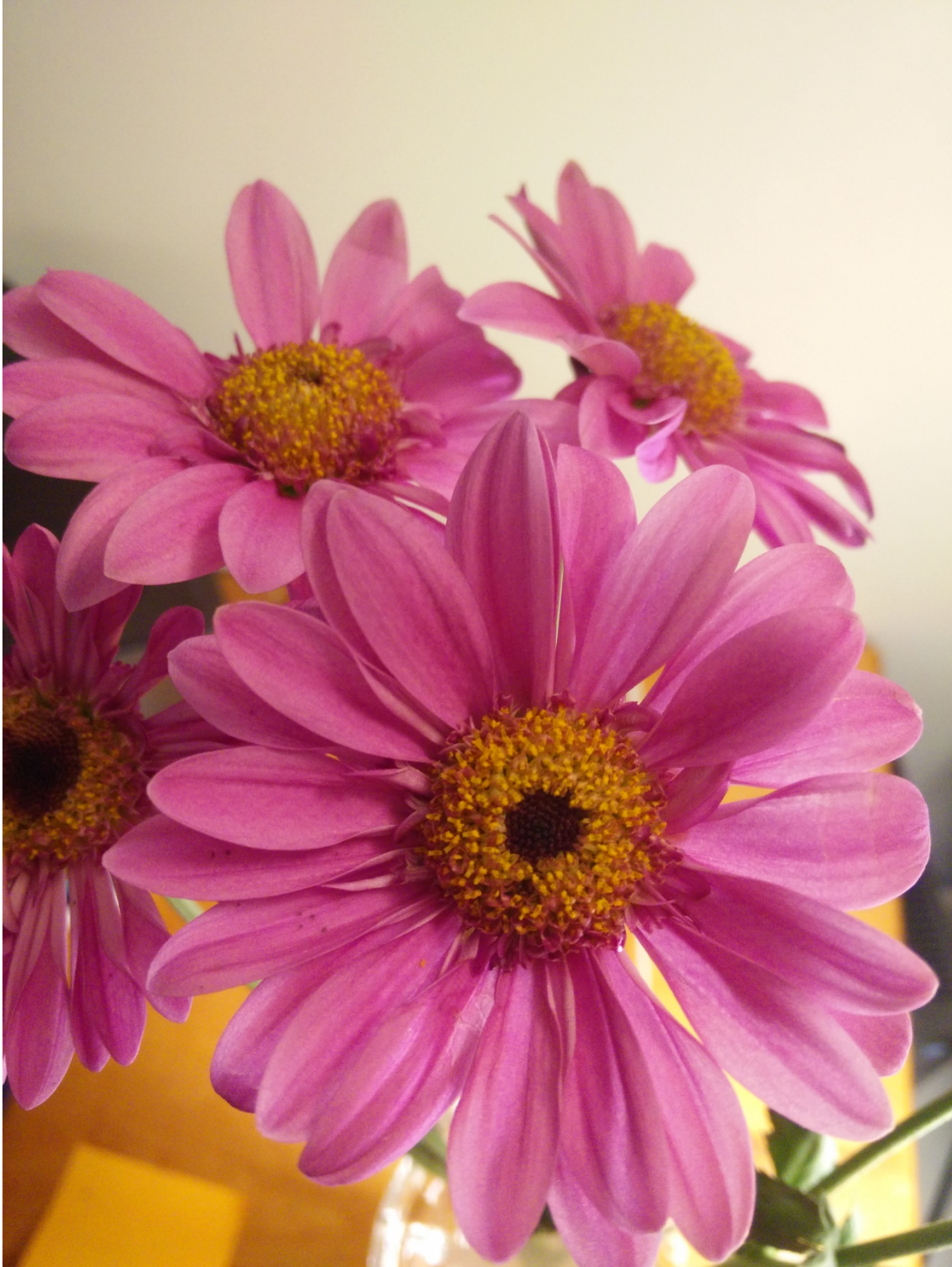
"Daisey" Photo by r.J. Hughes; 2017