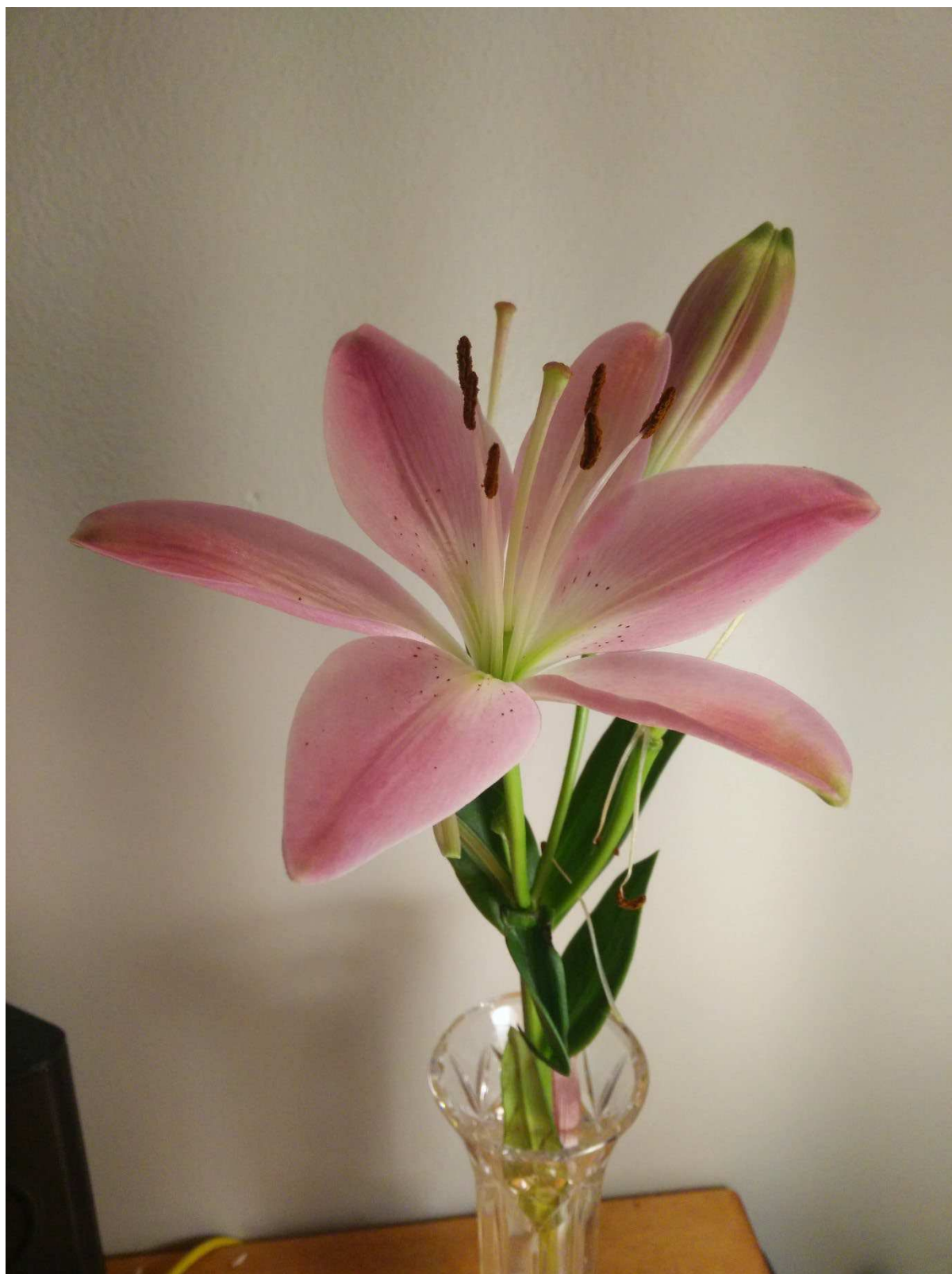
Lily in a Vase; Photo by R.J. Hughes; 2017