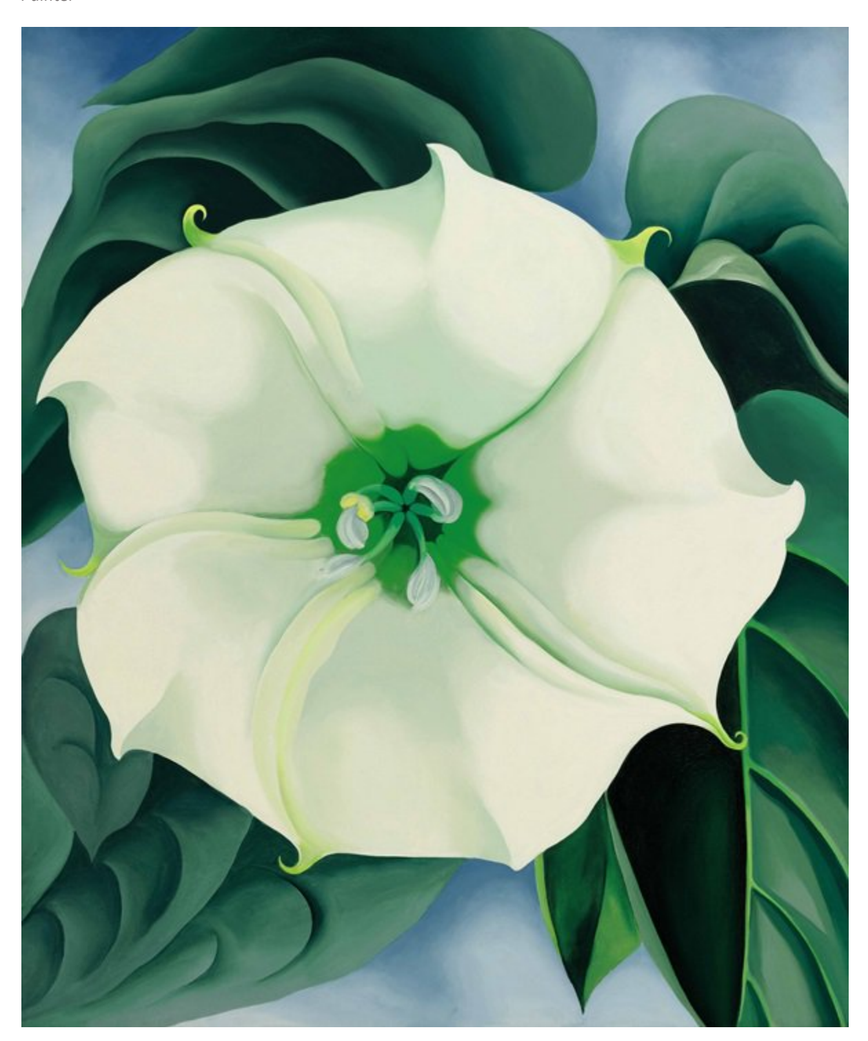
Figure 1:Jimson Weed No. 1 (1932). This painting sold in 2014 to Alice Walton (heiress of Walmart) for $44.4 million, making this the highest priced painting by a female artist ever sold at auction. Earlier, this painting hung in the White House during the George W. Bush administration at the request of Laura Bush. Walton subsequently donated the painting to the Crystal Bridges Museum of American Art in Bentonville, Arkansas, which Walton helped found. In 2016, this painting was displayed in the Tate Gallery, London, as part of a Georgia O'Keefe show in the United Kingdom.

In many parts of the world, this is an invasive weed...Georgia turned it to a beautiful masterpiece.