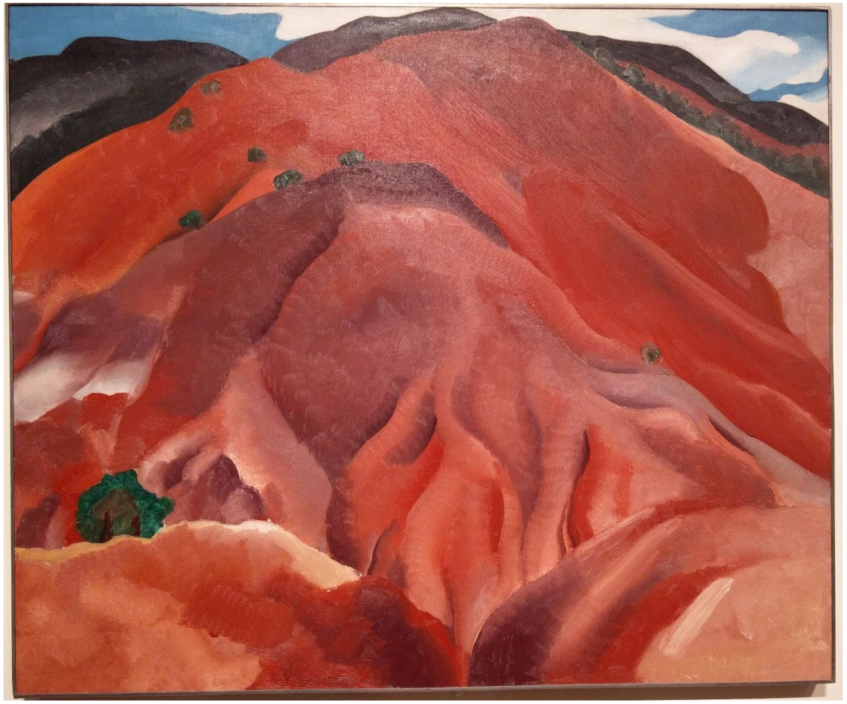
Above, Red Hills beyond Abiquiu, 1930. Oil on Canvas. Eiteljorg Museum of Native Americans and Western Art, Indianapolis Indiana. Below, on the left, detail or the tree ridge in "Red Hills" upper right corner. Below on the right, detail of the tree in the lower left corner. Note the loose brush strokes and swirls O'Keefe used to create her "trees" and "ridges".

The Eiteljorg posted the following quote from O'Keefe with this beautiful landscape: "A red hill doesn't touch everyone's heart as it touches mine and I suppose there is no reason why it should. The red hill is a piece of the badlands where even the grass is gone. Badlands roll away outside my door-hill after hill..."