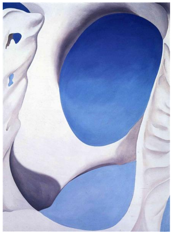
Horns and Feathers, 1937